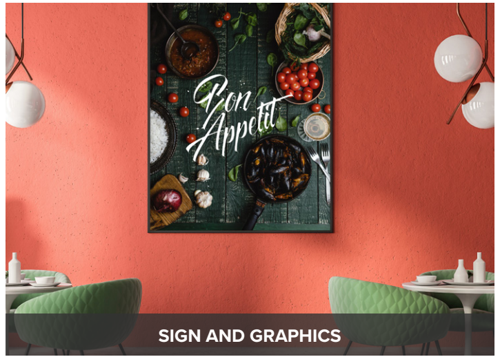
SIGN AND GRAPHICS